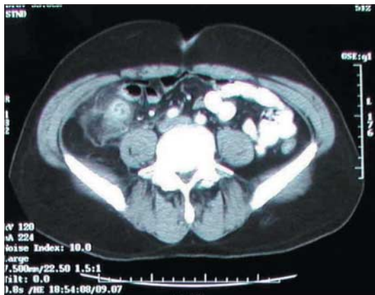
Fig 1 Computed tomography scan showing inflammatory mass in right iliac fossa secondary to acute appendicitis

However, two prospective studies have evaluated the use of computed tomography, and both showed a decrease in the number of unnecessary admissions and appendicectomies. w10 w11 Importantly, some authors have highlighted the risk of unnecessary exposure to ionising radiation caused by excessive use of computed tomography scans, and low dose protocols have been advocated. w12