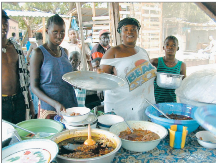
Food Seller, Gambia.

The coexistence of underweight and overweight poses a challenge to public health programs, since the aims of programs to reduce undernutrition are obviously in conflict with those for obesity preven-